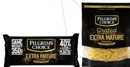
Any brand of flexible plastic cheese protective plastic film